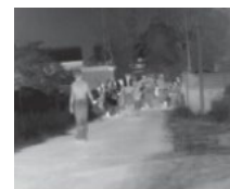
Night Vision with Thermal System