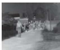
Night Vision with Thermal System