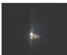
CCD Night Vision