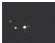
CCD Night Vision