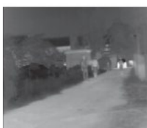
Night Vision with Thermal System

www.infraredcamerasinc.com | sales@infraredcamerasinc.com